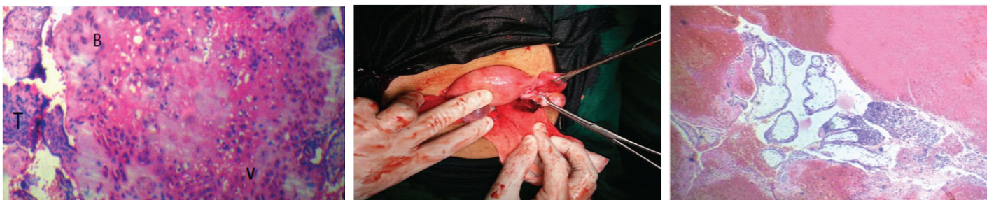
[Table/Fig-4]: Histopathological finding of ovarian pregnancy . Gestational trophoblastic tissue with blood clot (B), vascularised chorionic villi (V) and trophoblastic hyperplasia (T). H&E stain, 100X